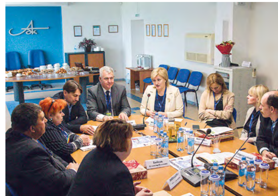
APPM hosting RAO Bumprom visiting meeting