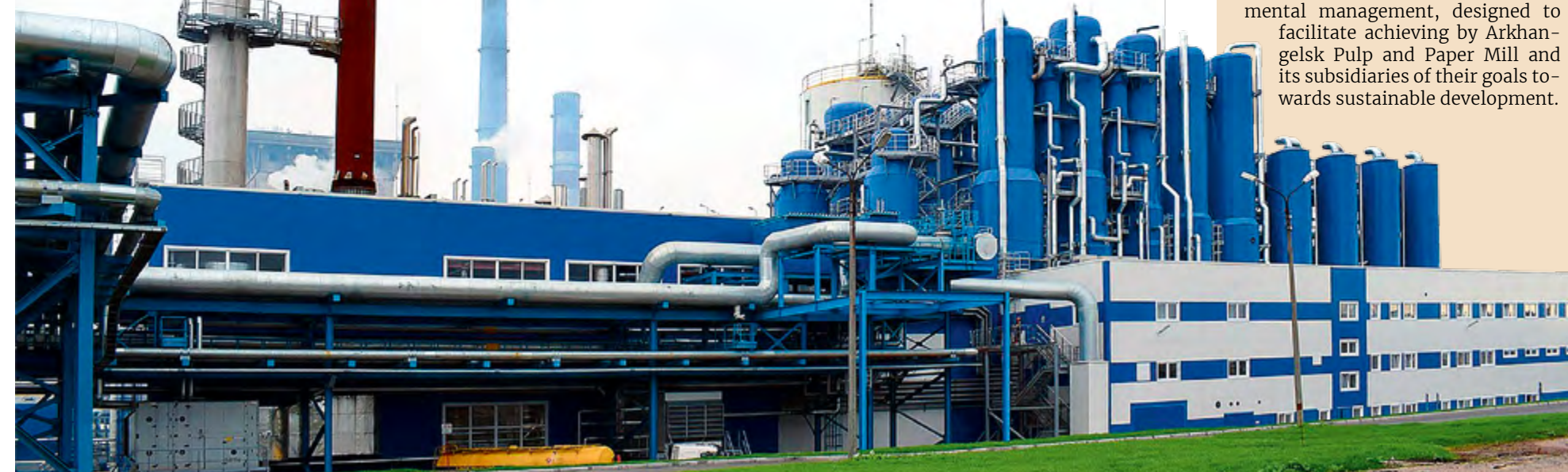
APPM launched its new evaporator plant in 2020