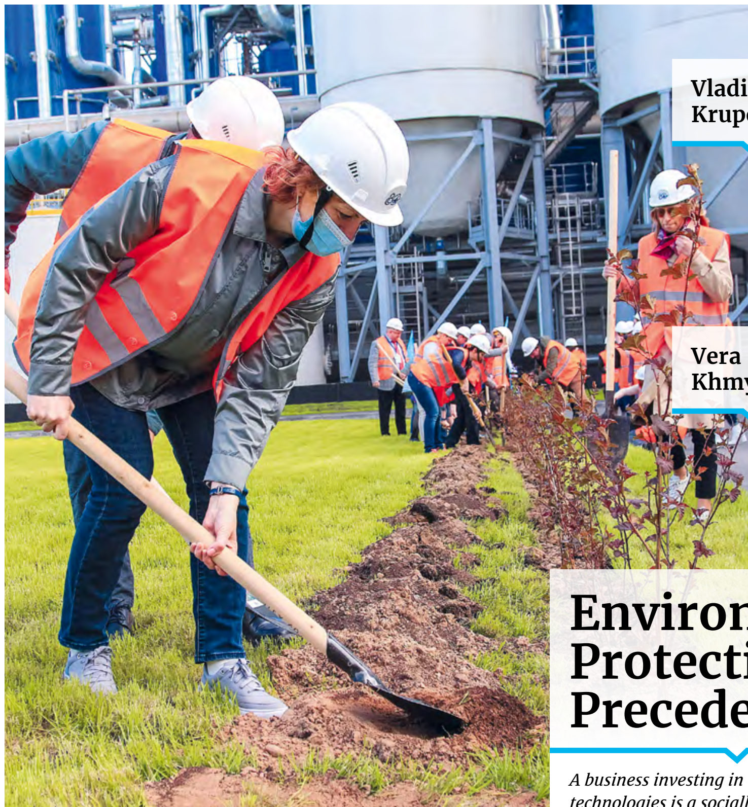
Planting trees near APPM's new evaporator plant